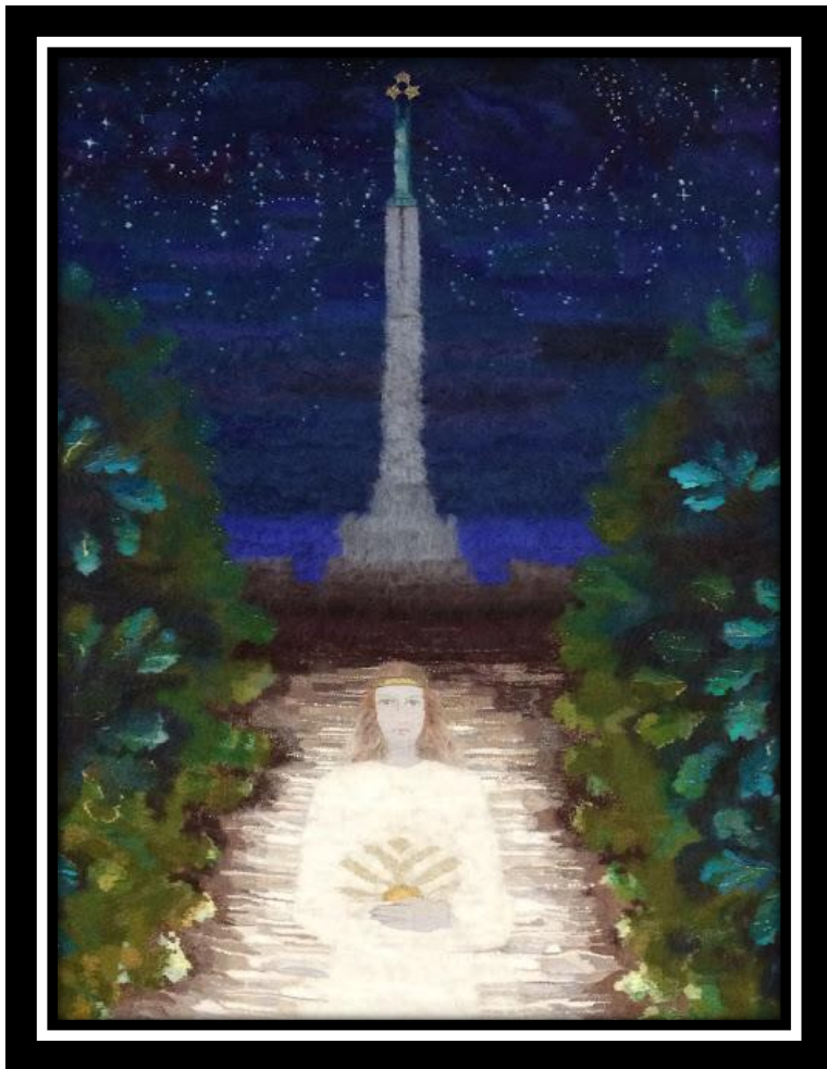
“HOPE” by Latvian artist Edite Pauls-Vignere. Gifted to the UN in 1994 by Latvia.

CEDAW Committee General Recommendation GR 24 mentions abortion in this way: “When possible, legislation criminalizing abortion could be amended to remove punitive provisions imposed on women who undergo abortion.” (This language appears in a GR but nowhere in the general text of CEDAW) The GR does not advocate for abortion, or define abortion as a basic human right.)