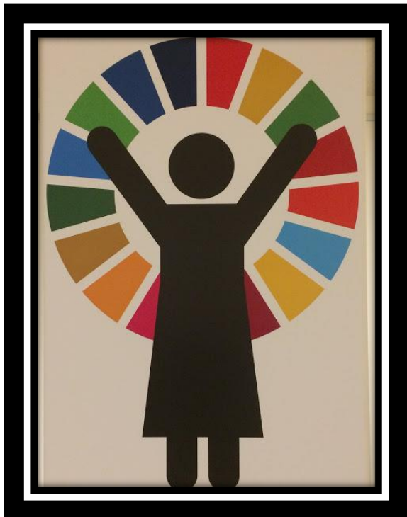
Poster at UN headquarters (2019) depicts women’s empowerment as a cross cutting theme for the attainment of all Sustainable Development Goals and the attainment of women’s human rights.

YES. -NGOs provide the CEDAW Committee with “shadow reports.” These reports give factual local information about the status of women. -NGO’s may comment on the official government reporting from their home country. Their report may be either in person at a hearing or in writing to the CEDAW Committee. -NGO’s may suggest questions to be asked of their home country’s delegation to the CEDAW Committee. NGOs may also serve as consultants to the Rapporteur during the writing of the Concluding Observations.