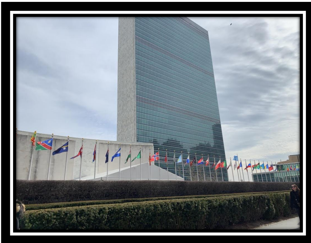
UN headquarters NYC

Briefing Book on Human Rights, First Edition: Synergy Between Policies of the League of Women Voters and United Nations Human Rights Conventions. 2019-2020. https://bit.ly/HR-SIG