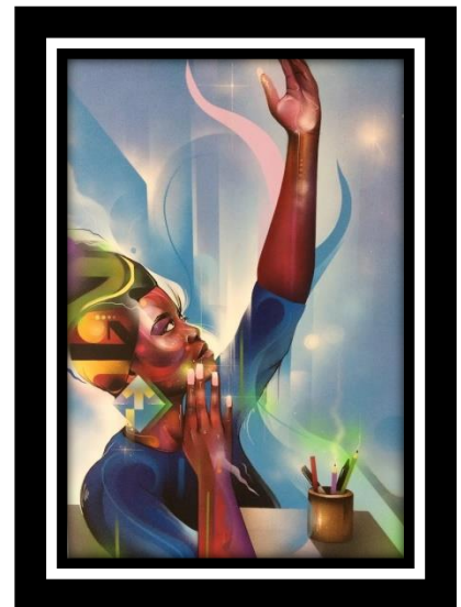
Mural near UN headquarters 2019

Convention on the Elimination of All Forms of Discrimination Against Women