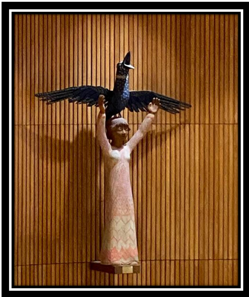
Sculpture by Danish artist Starcke represents hope. The sculpture is in the Trusteeship Chamber, UN headquarters, NYC.