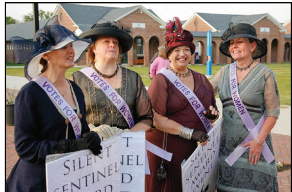
"Suffragists" on hand to make sure event is properly run.