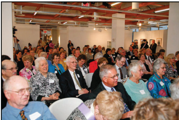
Silent Sentinel Award audience enjoy program in art gallery.