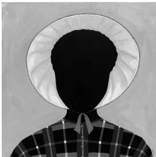
Silhouette of Emily Edmondson

On Saturday, 11 March from 1:00 to 3:00 p.m., our LWV chapter will also be co-sponsoring with the Fairfax County Public Library a Women's History Month Children's Art Project. This will be an in-person event at the Lorton Library Branch, geared