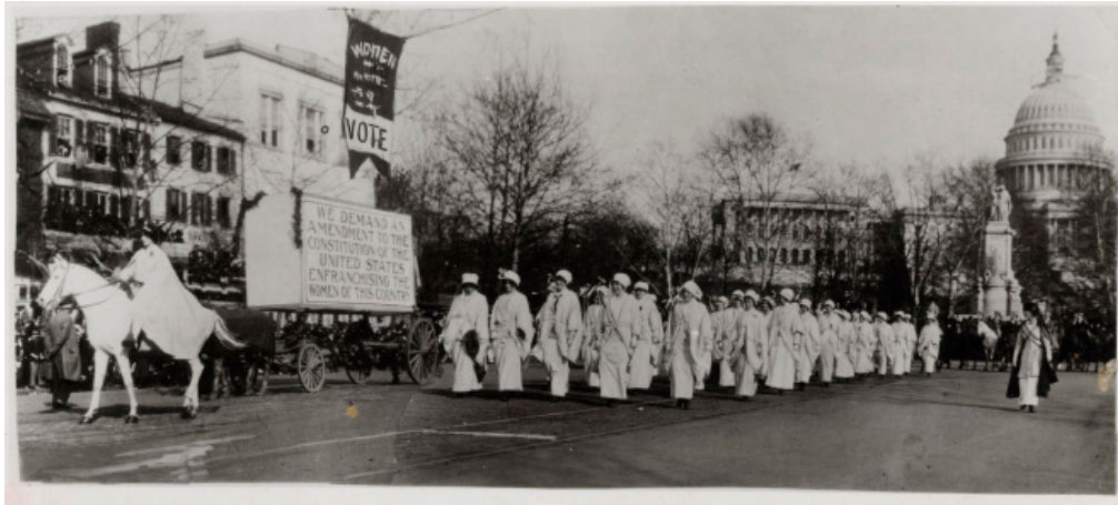
National Archives Photo # 24520426